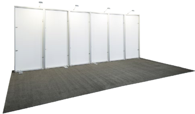
10 x 20 ft. frame