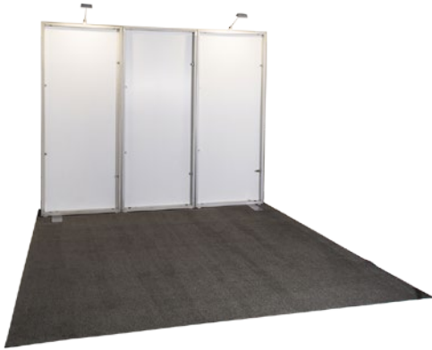
10 x 10 ft. frame

This option is available for customers who have previously rented the SmartFabric™ Rental Exhibit and are reusing their graphics. Fabric from other sources will not be installed on this Freeman frame rental. If you need Freeman to create a new graphic, please select the SmartFabric™ Rental Exhibit. No fabric graphics will be provided separate from the rental unit.