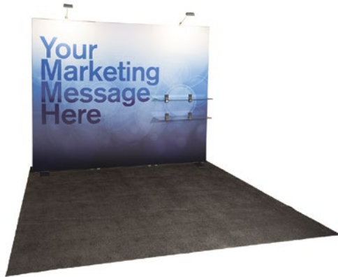
10 x 10 ft. unit