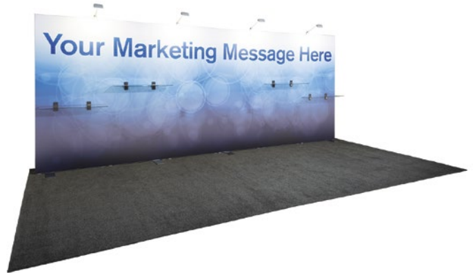
10 x 20 ft. unit