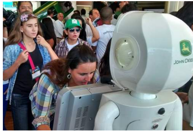
She'll draw people to your booth!