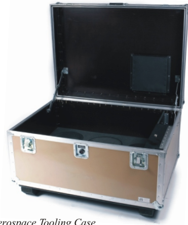
Aerospace Tooling Case