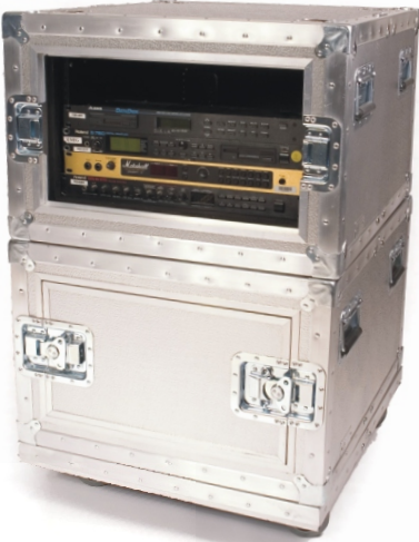
2 - 6 Space Kriz-Kraft racks joined with Roto-Locks