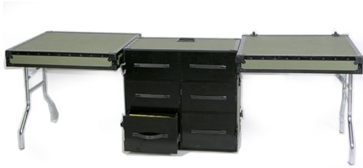
Standard Double-Opening Field Desk

We manufacture cases that are compliant with ATA Spec 300 Category 1 specifications, as well as most MIL-SPEC /MIL-STD standards. Some of these special options are: