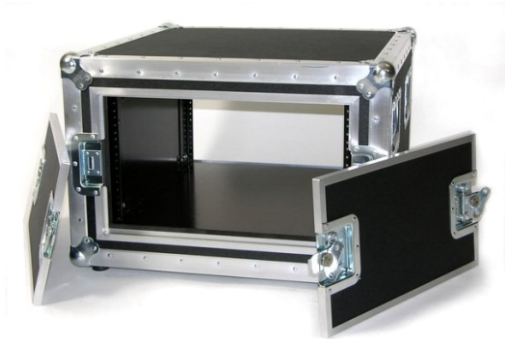
Kriz-Kraft 6 Space 2" Shockmount Rack