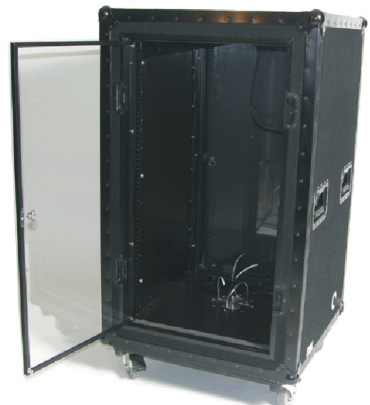
Cooling Fans On Moving 100 Cubic Feet of Air Per Minute