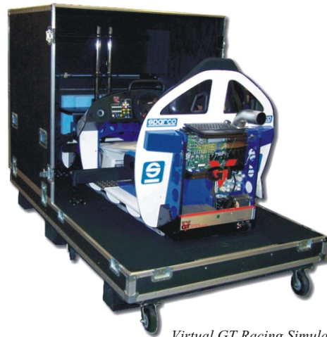
Virtual GT Racing Simulator

Some industries have exceptionally specific needs, and that's why they come to us. Our expertise gives us the ability to adapt and innovate in order to create cases that will protect even the most unique equipment.