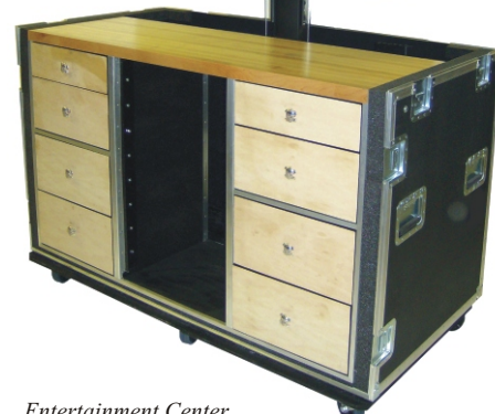
Entertainment Center with Plasma/LCD Lift on tour