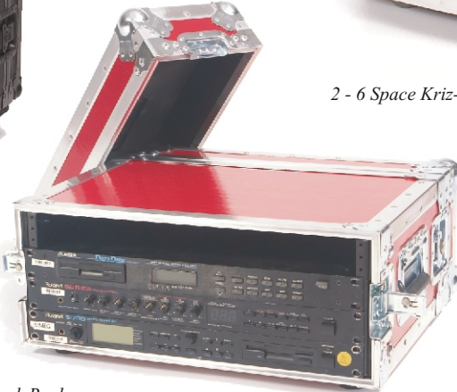
4 Space Non-Shock Rack