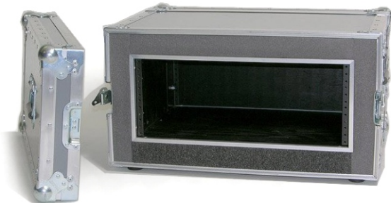
A&S 4 Space 2" Shockmount Rack

We manufacture racks of all specifications to suit your rack-mountable case needs. Our Kriz-Kraft brand, the strongest rack case in the industry, offers easily removable doors to give you more options.