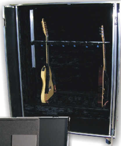
The A&S Axe Box™