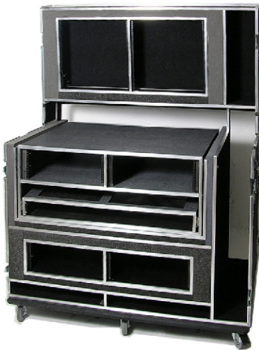
Mobile Video Editing Station