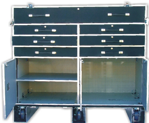
FlyWeight™ Tool Case used in Champ Car Racing Series