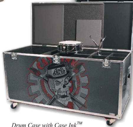
Drum Case with Case Ink™