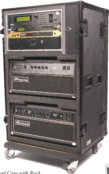
2 in 1 Head Case with Rack