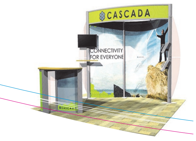
EXHIBIT SALES AND RENTALS

ELITEXPO offers a full line of trade show exhibits from 8' pop-up displays to customizable, large-scale island and peninsula exhibits. We have a wide array of exhibits available as rental units, as well. Our graphics team can produce your exhibit branding from your art files or we can custom design the perfect imaging for your booth.